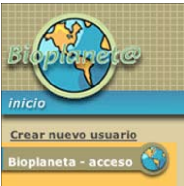
Bioplaneta, facilitating social and technical network connections