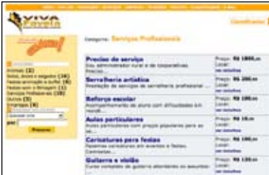
Viva Favela, supporting self-governing favelas