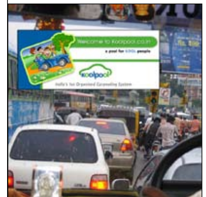
Koolpool, ride sharing via SMS

Perhaps the most promising use of lightweight technologies in the developing world has been to enable ad hoc responses to disasters and humanitarian crises. Unlike the industrialized nations, where disaster planning and emergency response have been increasingly the function of professionalized government agencies, developing countries lack capacity to respond effectively to disasters. Even in rich nations such as the United States, disasters that affect a wide area (like Hurricane Katrina) can overwhelm official response capacity.