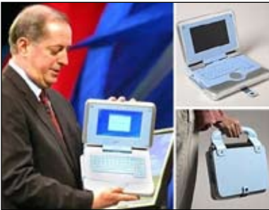
Eduwise, low-cost laptop

However, as much as these trends highlight the virtues of lightweight infrastructure—wide-spread, low-cost access to learning experiences and basic information—they also illustrate the way in which lightweight systems leverage and connect to more traditional heavy infrastructure. For instance, to achieve the necessary manufacturing economies of scale needed, the proponents of the $100 laptop have publicly stated that they need five countries to each commit to no fewer than 1 million units. And it is crucial to note that these units are not being marketed directly to students—the state-run educational mega-infrastructures of Thailand, Cambodia and other nations are instrumental players in procuring, distributing, and (hopefully, as this is not clear) supporting and maintaining the devices and broadband connectivity.