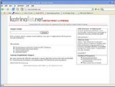
Katrinalist.net, post-disaster information Web site