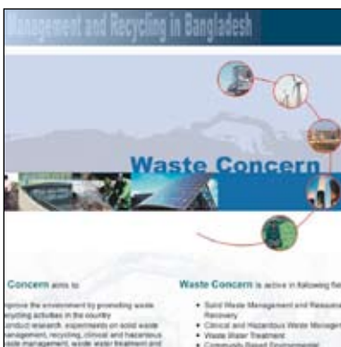
Waste Concern, sustainable and economically successful waste-collection venture

The isolation of poor communities has often benefited big business—price differentials can be maintained, advertising messages can be precisely targeted, and competitors monitored and contained. However, experiments such as Kiva's peer-to-peer lending and Koolpool's SMS-based carpooling suggest that the new opportunities in developing countries lie in connecting isolated communities and individuals together. While economic globalization has leveled the playing field between countries, it has done little to break down barriers at the local level, where the real future gains in innovative capacity lie. Becoming a trusted connector positions firms well to tap into new innovations and practices that emerge from these urban wilderness areas.