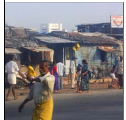
Urban wilderness in Mumbai, India

By focusing on individuals outside of their connections, marketers, for example, will miss out on the bigger social picture of how products create value or unintended consequences